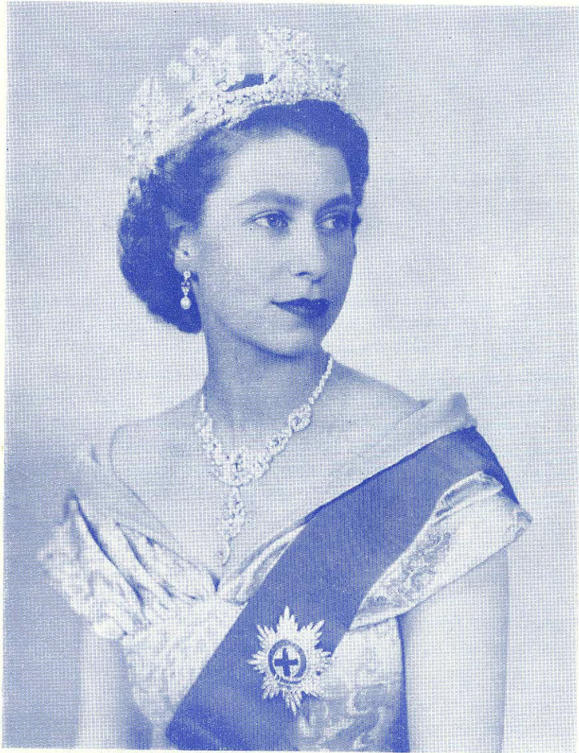
Portrait by Dorothy Wilding, London